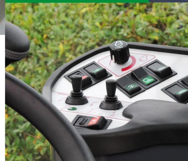
Full control at hand

The Timan 3330 control panel has been developed together with those who operate the machine on a daily basis. Cruise control, electronic hand throttle and Stop & Go are standard features of the machine.