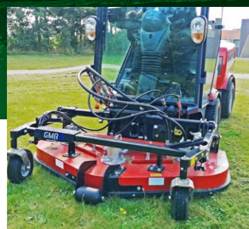
Rotary mower GMR Powerful grass cutter for efficient work. Cutting height and tilt-up controlled hydraulically. Cutting width of 1530 mm.