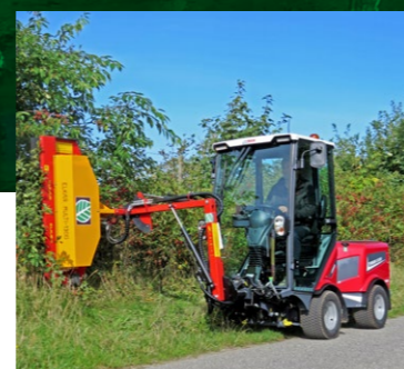
Multi-trimming hedge trimmer Offers a precise and uniform result, and cuts and shreds the material in one go. Change sides of the trimmer hydraulically. Cutting width 1300 mm.