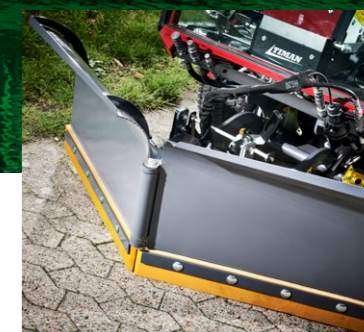
V-plow The 3 hydraulic settings enable you to clear large amounts of snow and ensures free and safe passage.