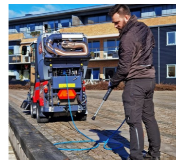
High-pressure washer Rediger High-pressure washer. With the 10-metre-long hose-pipe and 120-litre tank capacity, the pressure washer can be used continuously for 20 minutes. Automatic hose reel.