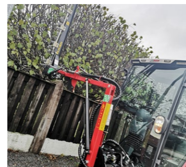
Hedge trimmer The hedge trimmer offers a precise and uniform result for hedges, bushes and plants close to the ground. Cuts both horizontally and vertically.