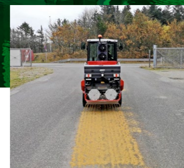
CS-200 Available as drop spreader or as Combi Spreader. Spreading width adjustable from 1 meter to 6 meters.