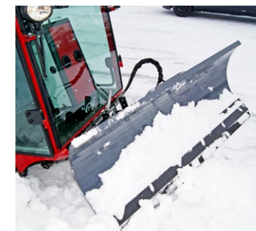
Dozer blade The tool has a working width of 1350 mm and offers great capacity for great amounts of snow. Supplied as standard with a safety tilt and rubber edge.