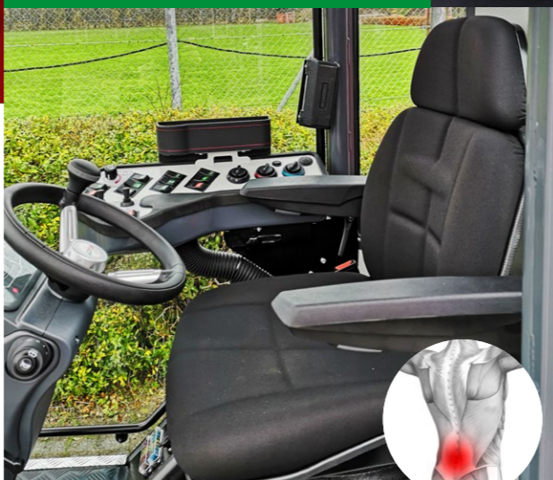
Fully adjustable driver's seat

Forget about hip and back pain. Height adjustment, lumbar support and ergonomic design guarantees maximum comfort.