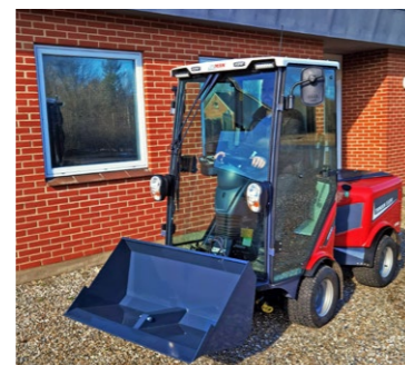
Hydraulic bucket No more awkward postures and heavy lifting. Use the bucket to spread gravel, sand and wood chips.