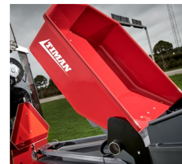
Tipping trough The tipping trough can be emptied hydraulically into the spreader while driving. This provides double the capacity. Advantageous in combination with the Combi Spreader CS-200.