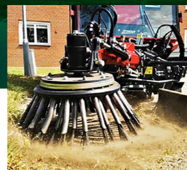
Weed brush with suction device Put an end to pesticides and other environmentally harmful substances. Remove and collect weeds in just one operation, so you don't have to double the work.