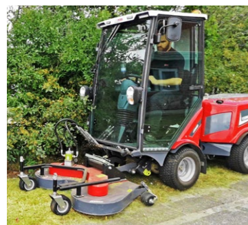
Rotary mower 1350 Grass cutter with heart-shaped blade cover allows you to cut right up to lampposts etc. Cutting width of 1350 mm.