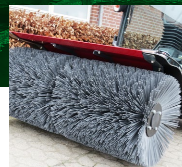
Sweeping roller The hydraulic settings of the sweeping roller with built-in floating position and parallel displacement makes it suitable for sweeping all year round. 1,200 mm width, Ø 550 mm.