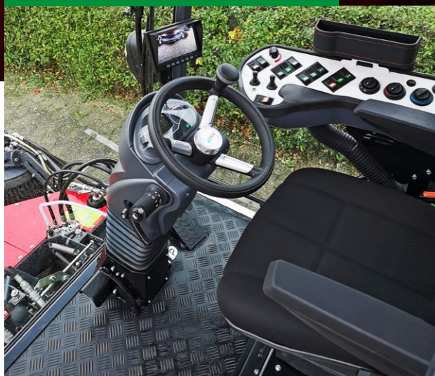
Low noise level and plenty of space

Forget hearing protection and enjoy your music. Gone are the days of stressful and uncomfortable work with just 68 dB at 2,600 rpm in the spacious, air-conditioned cabin.